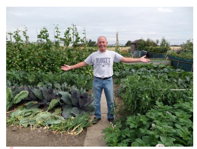
Highly Commended: Plots 55; 35; 51; 9; 10; 21; 18a; 27 & 36